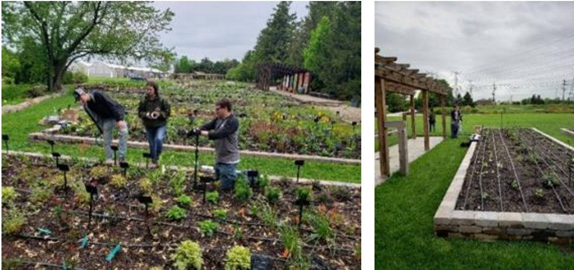
Figure 1. Site 1 (left) is a perennial garden plot; Site 2 (right) is vegetable garden plot.

Site 1 is a perennial display bed in the shade near a creek that is prone to flooding. Site 2 is a vegetable display bed at higher ground and in full sun (Fig. 1).