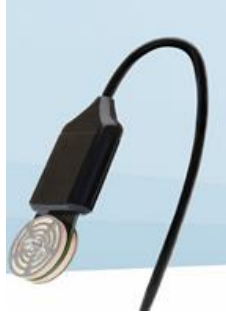
Terros 21. Matric Potential, Temperature