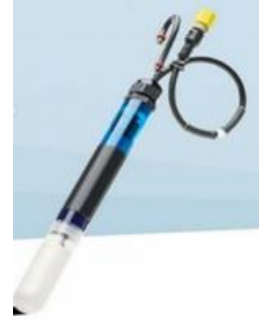
T8 Matric Potential