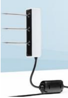
Terros 12. Moisture, Temperature, EC